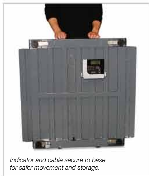
Indicator and cable secure to base for safer movement and storage.