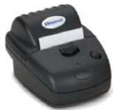
Shown with optional printer AWT05-505591