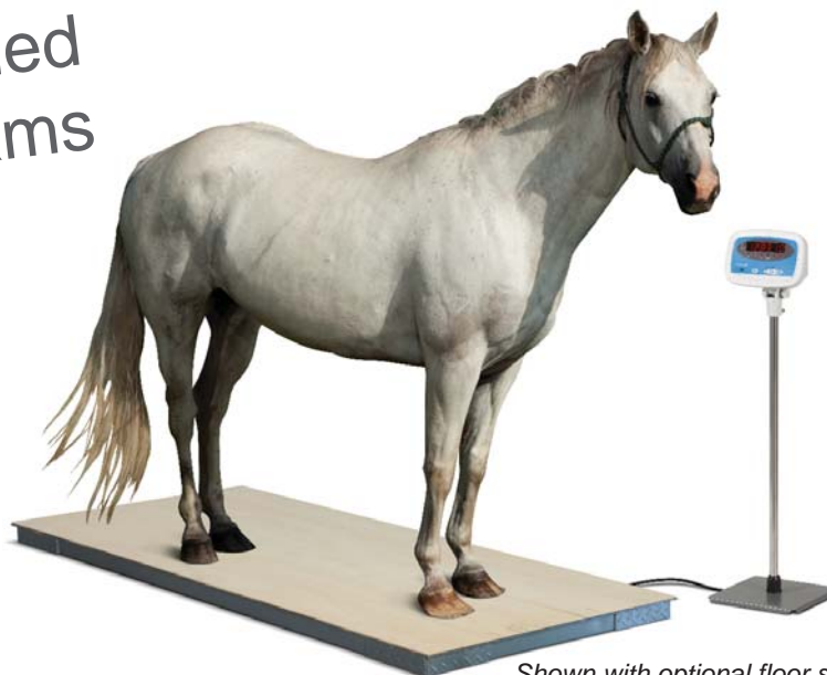
Shown with optional floor stand