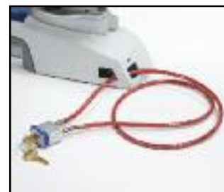
Security Device accessory (Lock & cable sold separately)